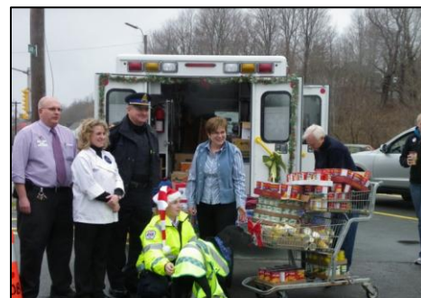
Annual Food Drive for Bridgewater Inter-Church Foodbank.

The Crime Prevention Programs we have initiated or become involved in enable the officers to communicate directly with the general public in a relaxed setting that is non-confrontational and is of benefit to all. As part of each General patrol members' duties, daily foot patrol, augmented by bicycle patrol during the summer months, allows officers to be more approachable. Past public surveys conducted by the CR Coordinator, indicate this is the type of policing desired by the citizens of Bridgewater.